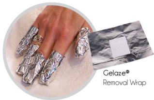
Gelaze® Removal Wrap